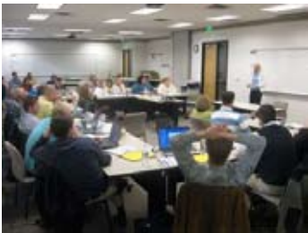
A recent Mental Health Facilitator training session

In December 2009, the Tanzania Network of Community Health Funds and the Guidance, Counselling and Youth Development Centre for Africa (GCYDCA), located in Malawi, partnered to hold a training of trainers in Dar Es Salaam, Tanzania. The